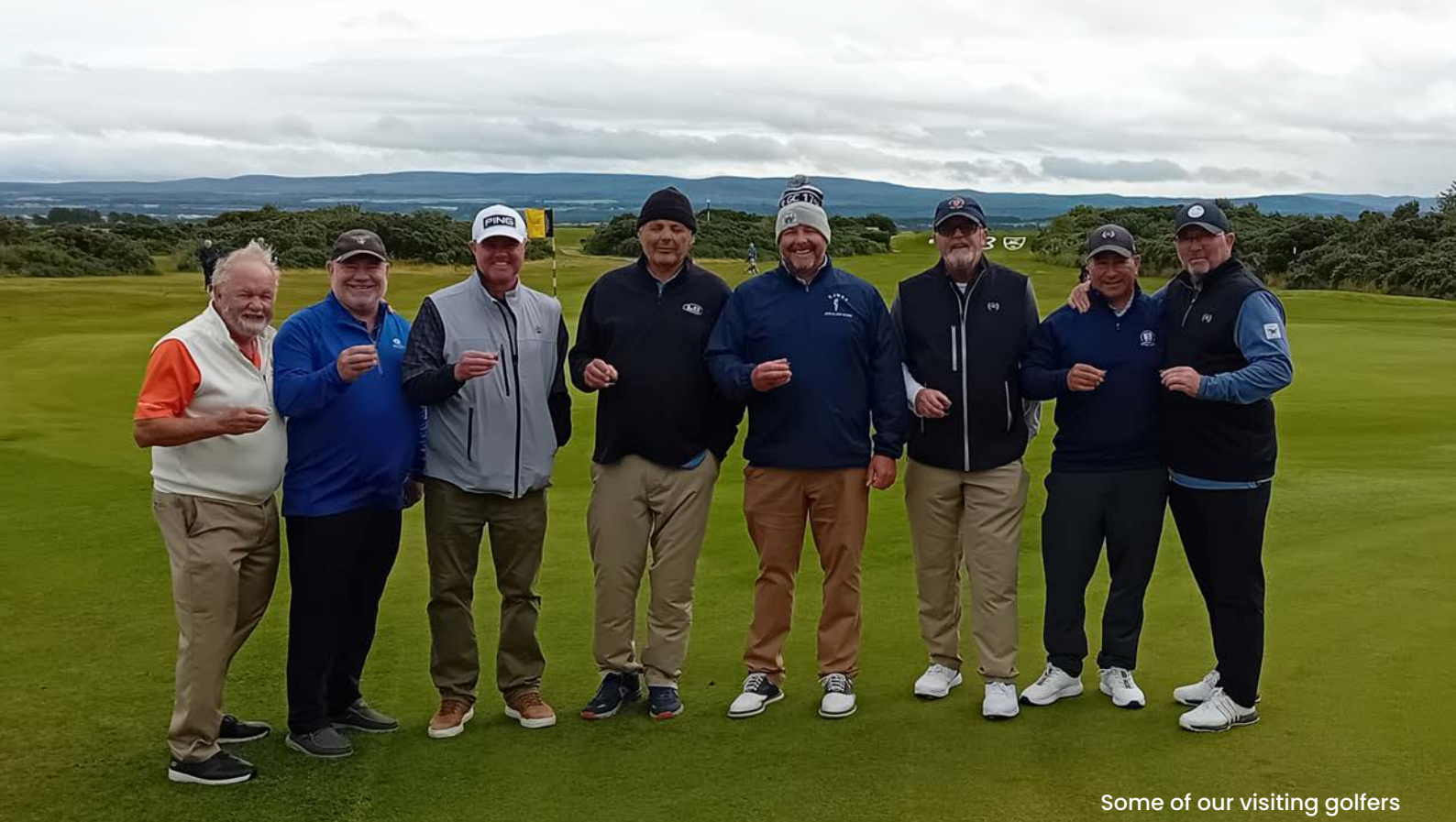
Some of our visiting golfers