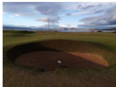
7 th greenside bunker